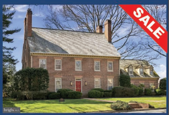
9394 Mount Vernon Cir | $1,875,000