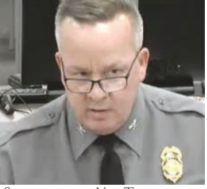
Screenshot YouTube video. March 12, 2024, Fairfax County Safety and Securi-TY MEETING

First, Next Steps 2024 begins with a detailed background on the national scene and its impact on Fairfax County. The murder of George Floyd, a Black man, by a white Minneapolis police officer in May