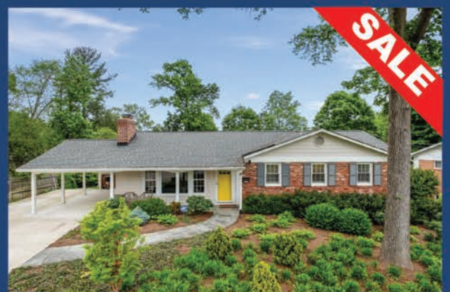
3425 Ramsgate Ter | $799,000