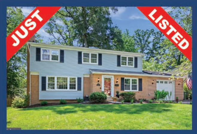
8337 Bound Brook Ln | $875,000

FAMILY REAL ESTATE OF LONG & FOSTER Leading the Area in Real Estate SOLD!!!!