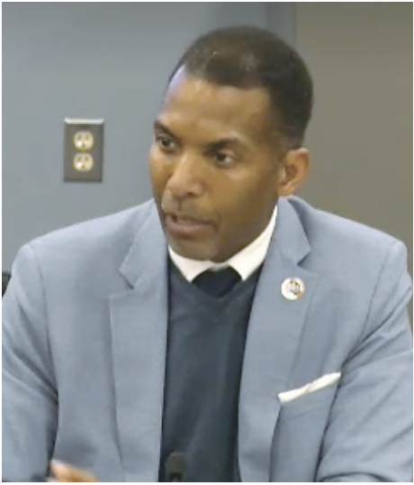
SAFETY AND SECURITY COMMITTEE MEETING March 12, 2024