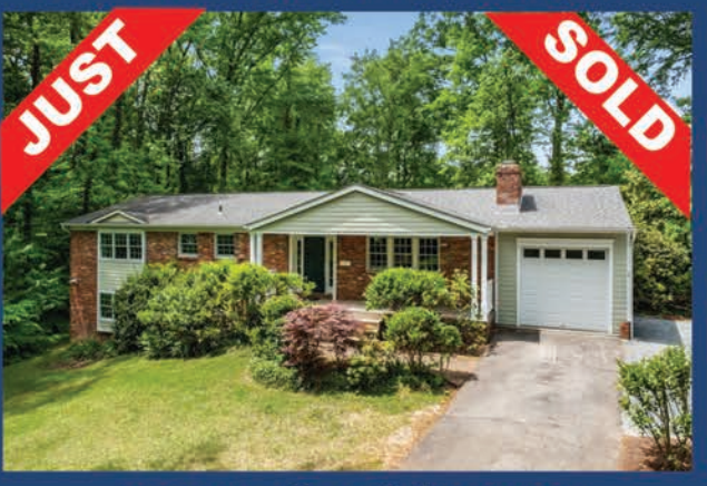
8228 Brady St | $880,000