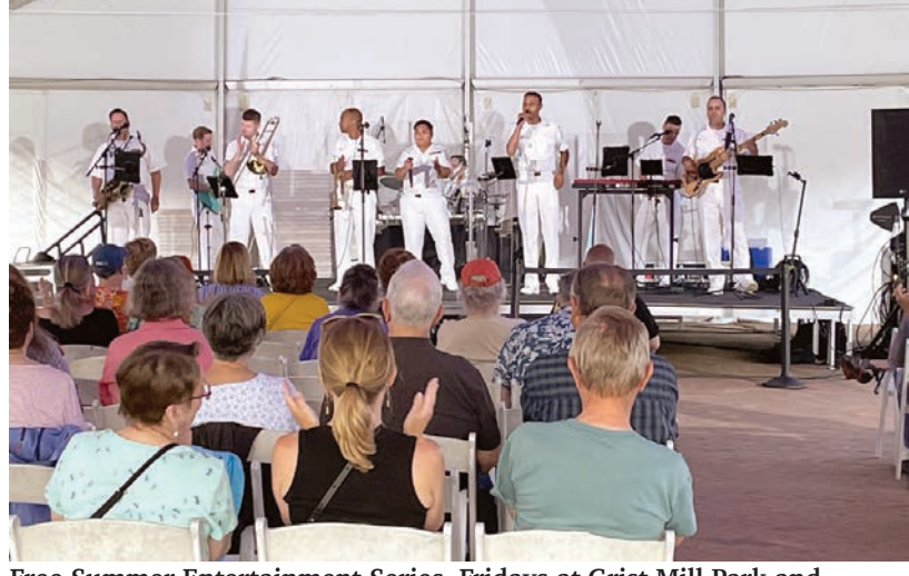
Free Summer Entertainment Series, Fridays at Grist Mill Park and Saturdays at the Workhouse Arts Center at 7:30 p.m. Stop by Fort Hunt Park every Sunday at 7 p.m. in Pavilion A.

hether you are traveling, have family visiting or enjoying a stay-cation, summer is the best time for FREE outdoor fun in Mount Vernon. The Park Authority's Summer Entertainment Series, Mount Vernon Nights