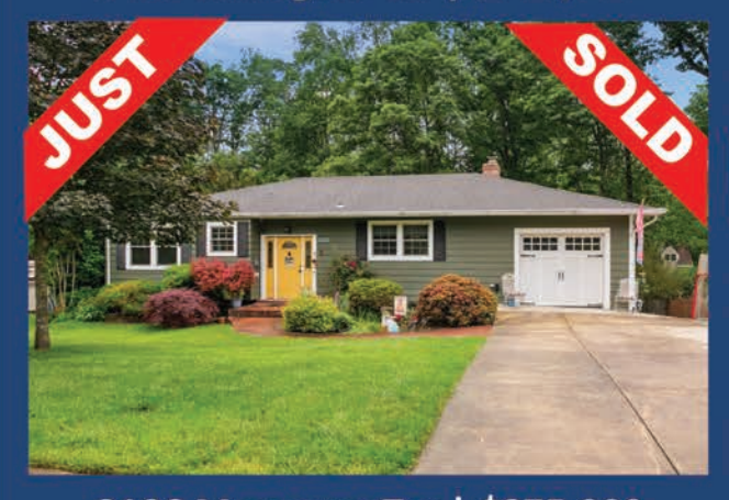
3106 Mcgeorge Ter | $875,000