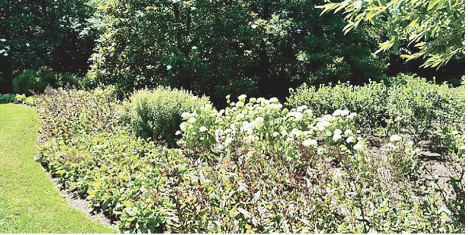
A new garden showcasing native plants in a traditional Virginia landscape setting now resides at River Farm, headquarters of the American Horticultural Society.