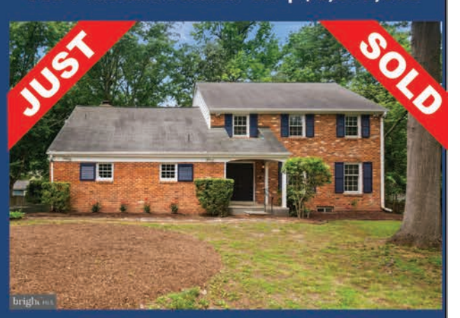
9330 Boothe St | $849,500