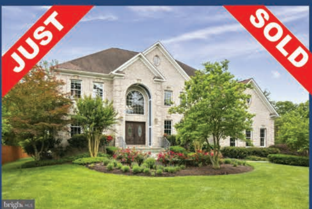
3725 Woodley Dr | $1,420,000