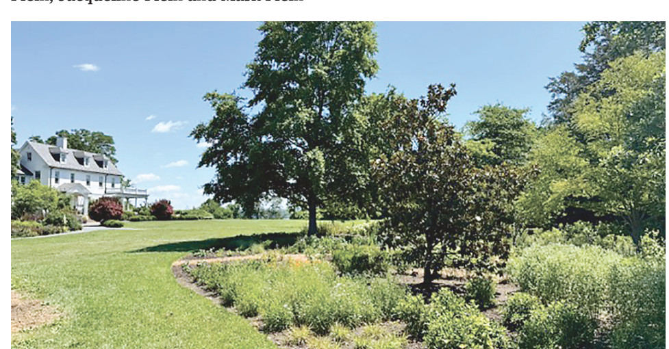
The new garden addition enhances River Farm's 25 acres of natural beauty and scenic landscape along the Potomac River.