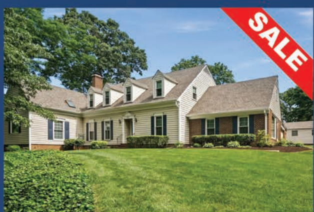
9223 Presidential Dr | $1,198,000