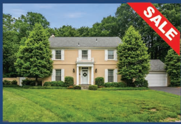
9301 Old Mansion Rd | $998,500